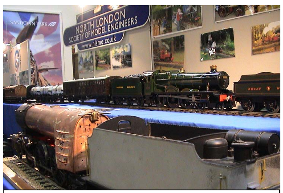
NLSME stand at Sandown Park exhibition.